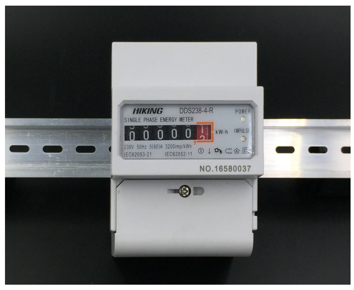
DDS238-4-R single phase din rail type watt hour meter (D1406)

The meter is designed to measure single phase two wire AC active energy like residential, utility and industrial application. It is a long life meter with the advantage of high stability, high over load capability, low power loss and small volume.