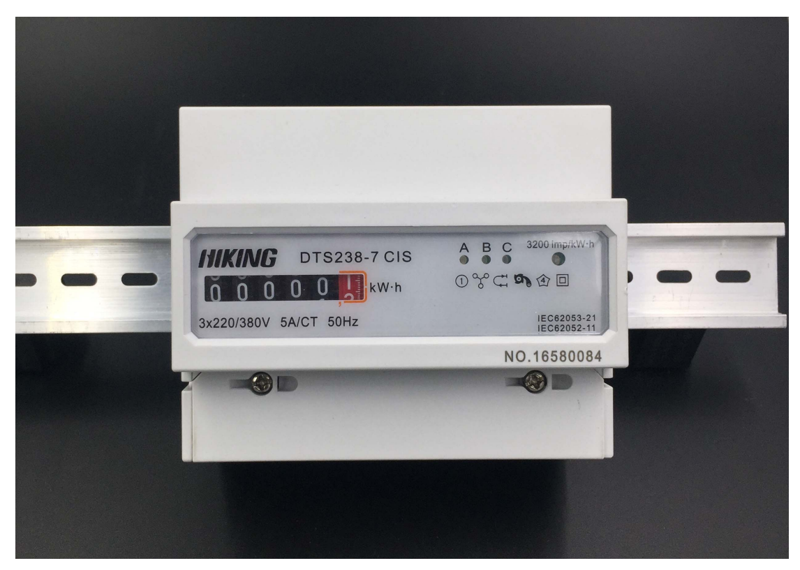
DTS238-7-R three phase din rail type watt hour meter (D3706)

The meter is used in three phase four wire/three phase three wire/two phase three wire power grid. The meter is designed to measure AC active energy. All of its functions comply with the relative technical requirement for class 1 three phase watt hour meter in IEC62053-21. It is a long life meter with the advantage of high stability, high over load capability, low power loss and small volume.